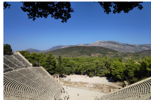
Excursion to an ancient Greek theater

One highlight was the poster session at the beach. There I presented my work titled “Phage therapy 2.0 – Engineering bacteriophages to overcome their natural limitations”. I had fruitful discussion about phage therapy and its applications. My favorite activity was the excursion to the ancient theater of Epidaurus. We visited the temple of Asclepius in Epidaurus with the adjacent theater. The acoustics created more than 2000 years ago were impressive.