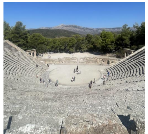
Excursion at the ancient theatre of Epidaurus